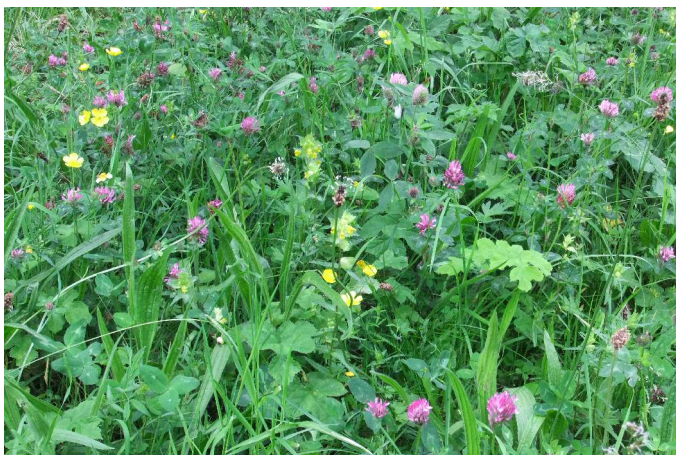
Flora including yellow rattle at Penterry Park

We also collected yellow rattle seeds at Penterry Park and will sow them back on site once the grass has been cut. This will help with the distribution of the seeds and give them a better chance of germination.