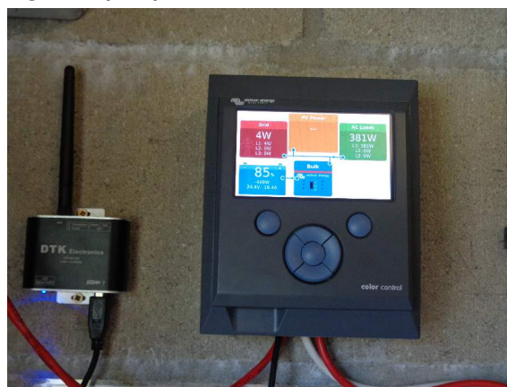
Trellech installation control unit

The government has imposed the new Feed-In Tariff conditions on renewables and as predicted installations have tailed off. Our energy group has had several lively meetings with a new member, Hilary Bown, who has made some very useful contributions helping us to make a proposal to Welsh Government to fund a battery storage tariff to encourage uptake. Our main project on battery storage for surplus solar power is making good progress. We have several systems installed, showing exceptional results on electricity bill savings for people.