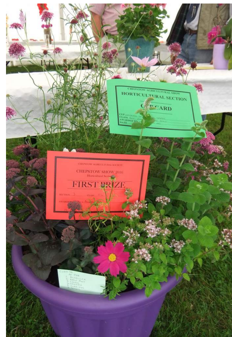
Pollinator Friendly Planter winning entry 2016