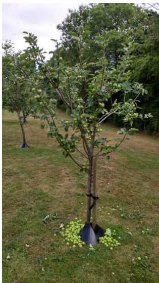
Apple tree in Wyebank Road community orchard in Sedbury pruned and with new strimmer guard!

If you have new ideas for apple-related themes or activities, or you would like to help coordinate, or your business or organisation would like to take a stall, or to find out more, please contact food@transitioncepstow.org.uk . We would particularly like to hear from anyone who would be interested in organising activities for children on the day.