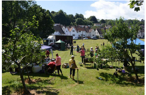
Garden City Centenary Fun Day In the foreground: community apple trees planted and maintained by Transition Chepstow

Garden City celebrated its centenary on 1 st July with a Fun Day including music, a dog show, a history display, and stalls and demonstrations by various groups. Transition Chepstow was represented by a stand and information display, as well as tours by Marc Carlton and Glyn Parkhouse of the wildflower area which Transition Chepstow has developed in Piggy's Hill.