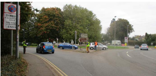
Transport Task Group measuring the A48 eastwards HBR access junction to validate the white line dual markings road improvement proposal

· Major reworking of the HBR also progresses with meetings with Welsh Government. With the coming elections to the Welsh Parliament, we would urge you to contact candidates to ensure their support of this project which is the only viable short-term solution.